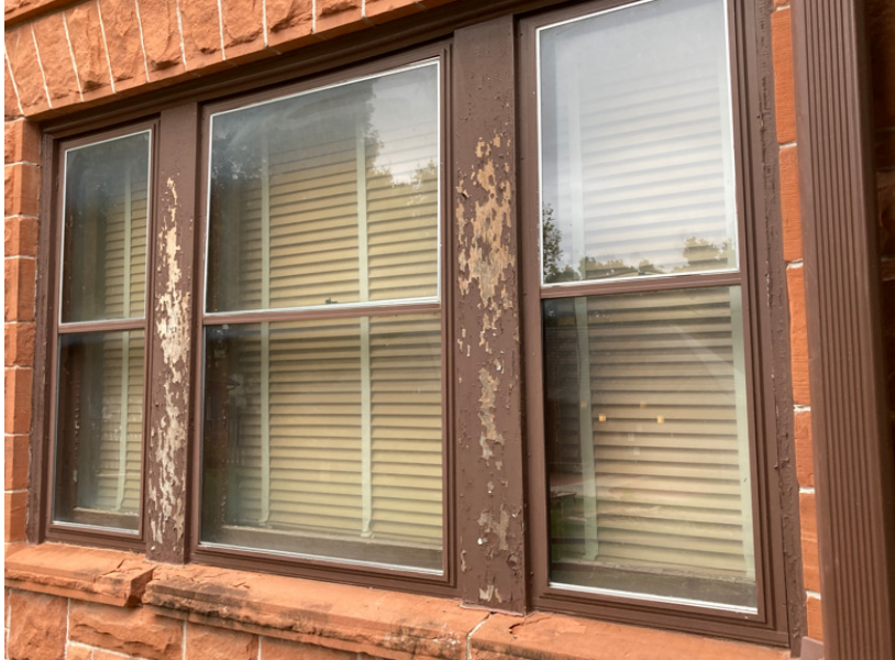
South exposure exterior wood trim requiring preservation repainting