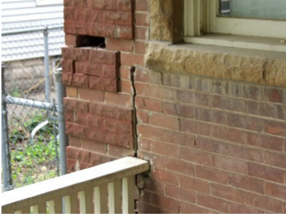
View showing missing brick and displaced corner.