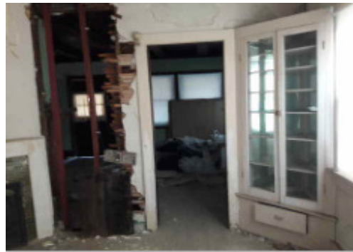
Interior stabilization to primer level for future