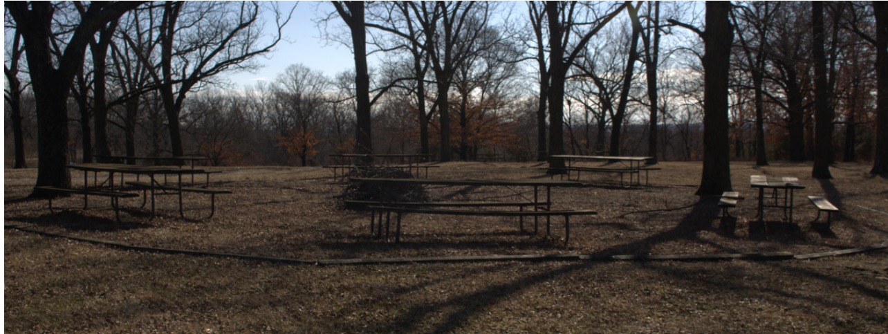
Visitor areas do not have basic water, toilet or ADA accommodations