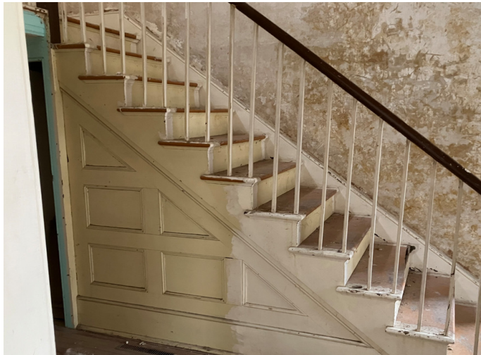
Interior main stair way