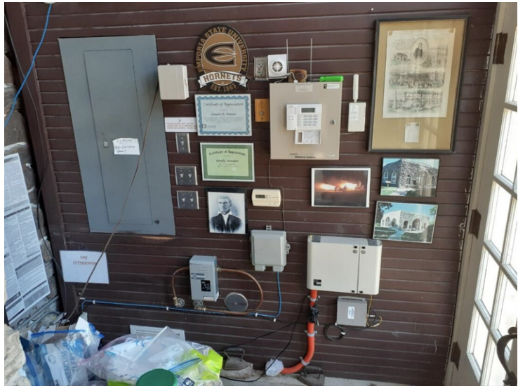
Existing open offices and mechanical controls are over crowding available space for visitors