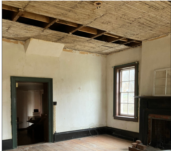
Interior partial exposed lath and plaster