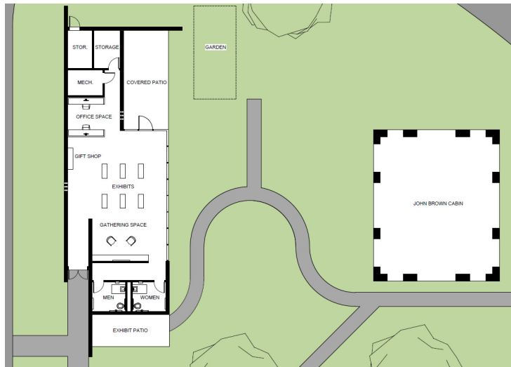
New visitor center concept adjacent to existing pavilion