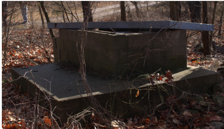
Replacement of non functional core infrastructure as in well house