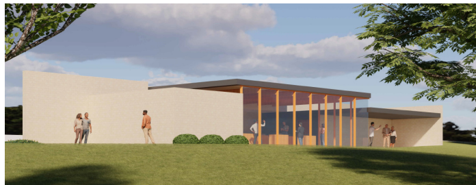
New visitor center overlooks existing building and park areas