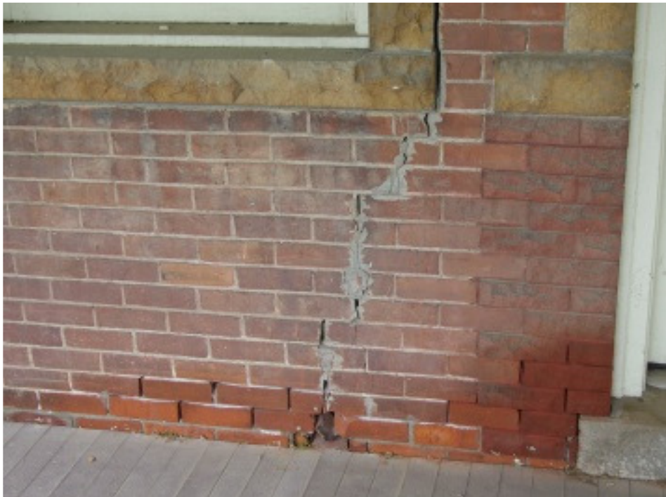
View showing movement crack and missing mortar.