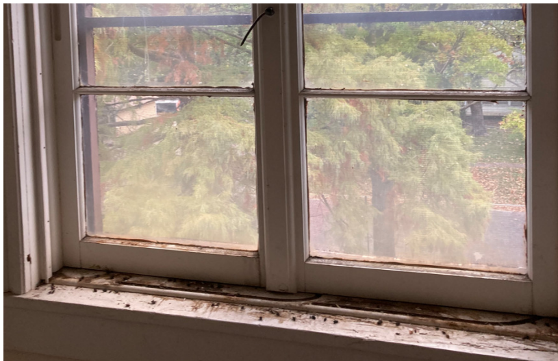
Window sash, muntin and stool requiring preservation repairs