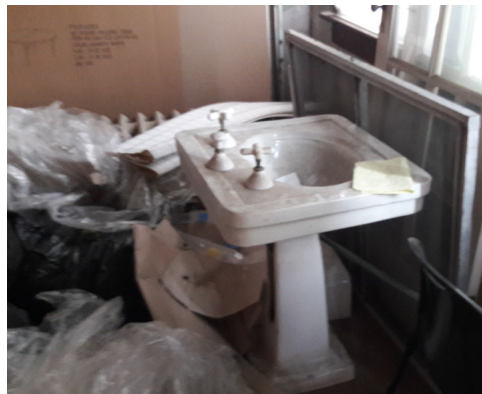
Mechanical, electrical and plumbing systems stabilizations