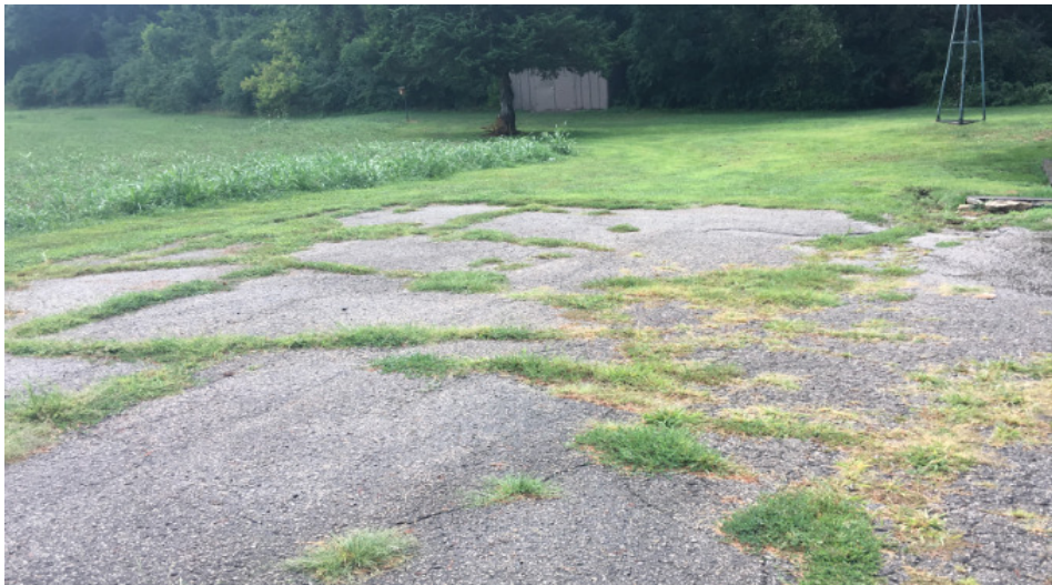
Parking field is end of life requiring replacement