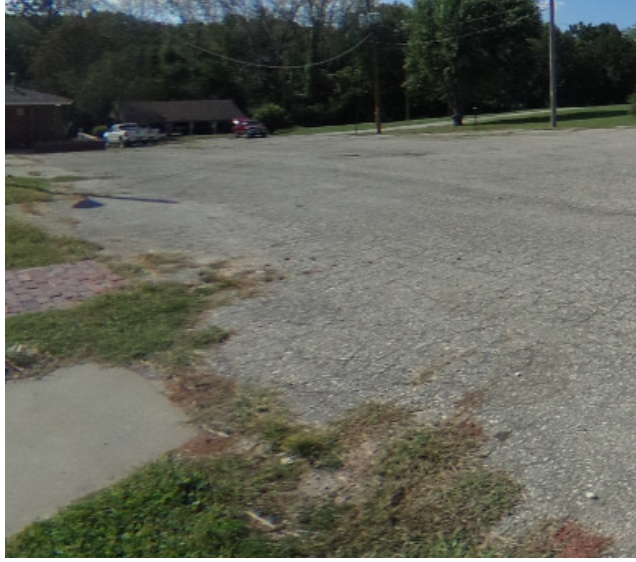
Grinter's current parking area and the ADA parking spots